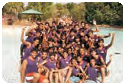
wide range of water activities