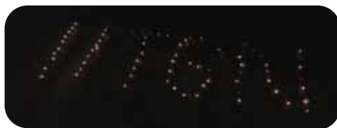
90 students with candles celebrating earth hour.

to create awareness about this day, turning off all lights and creating an IIT GN out