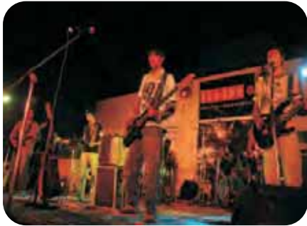
Souls of Centaur burning the stage

This was the “official icing on the cake” for Blithchron, organized on the final night of Blithchron. The prelims to String Theory were conducted on the previous day and out of the multitude of