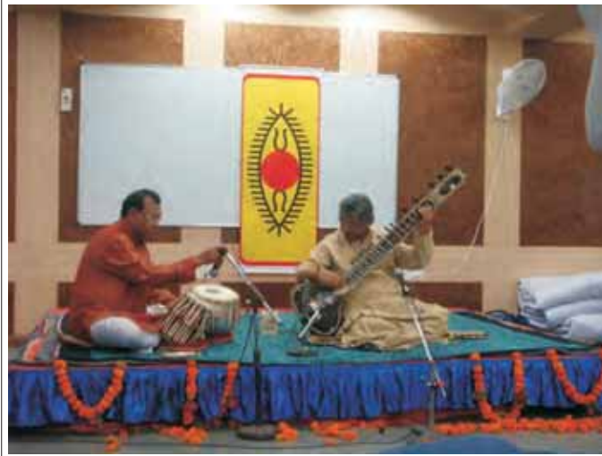
Pt. Debu Chaudhary at IIT GN

IIT GN's association with SPIC MACAY, a popular movement to promote Indian Classical Music amongst youth also started off in this very eventful year. A Sitar recital by Padma Bhushan Pt. Debu Chaudhary was organized on 4th of February which was appreciated by one and all. Pt. Debu