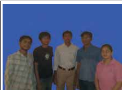
The newly elected student council of IIT-GN

A student body needs to be defined by leaders who can represent the students among the administration as well as other student bodies. This created a need for the IIT GN students to pick their representatives which would ensure the proper communication of their needs to the authorities, allowing IIT GN to develop at a rapid pace defined by the enthusiasm of the students and the dedication of the authorities. The first elected council consisted of a General Secretary, two Councilors to assist the General Secretary, a Mess, a Maintenance, a Sports and a Cultural Secretary. The