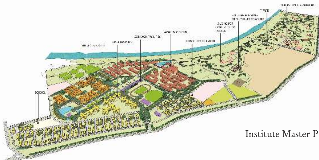
Institute Master Plan

IITGN has been provided about 400 acres on the eastern bank of the Sabarmati in Gandhinagar, opposite the Secretariat. The master plan of the campus took shape after several brain-storming sessions between a group of faculty members of the Institute and the consultants. The campus is envisioned to be compact, energy-efficient by minimizing energy consumption and making optimum use of natural resources by harvesting rain water. The campus will have clearly identified vehicle-free zones. The campus is being designed to facilitate close interaction between faculty and students and also between the various sections of the student community. After a careful selection process, M/s Green Campus Development Consortium, New Delhi was awarded the contract to develop the master plan of the campus.