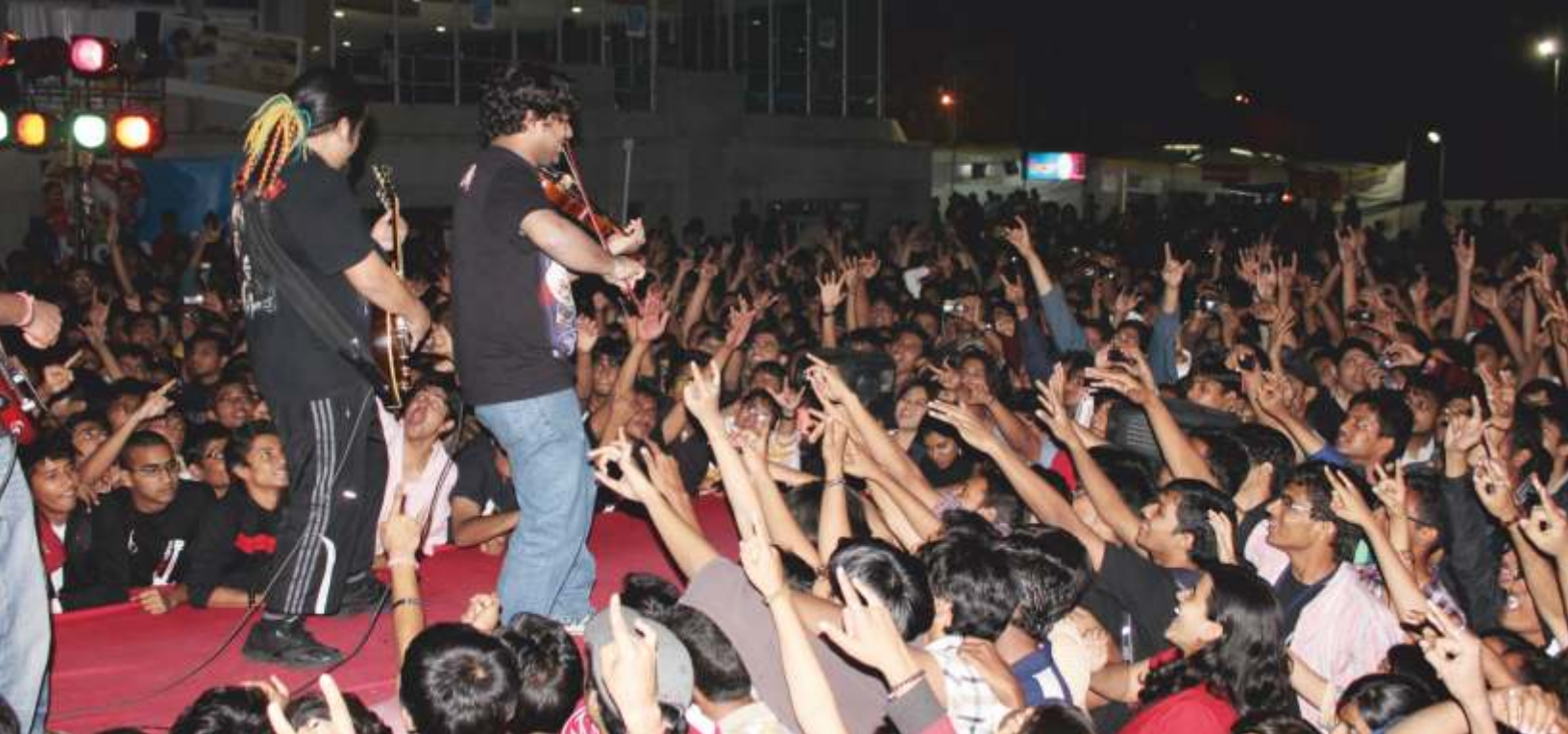
The rock band Parikrama performing at IITGN during Brithchron '10